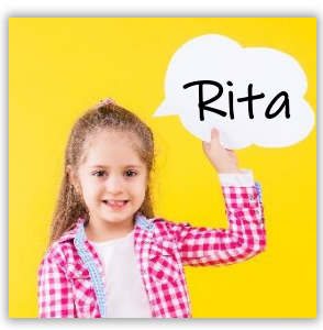
name (n.) My name is Rita.

A. Read aloud the vocabulary and example sentences below.