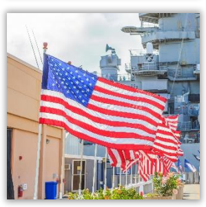
from (prep.) I'm from America.