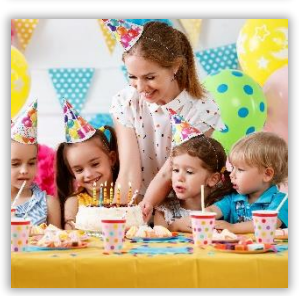
birthday (n.)My birthday is on June seventeenth.