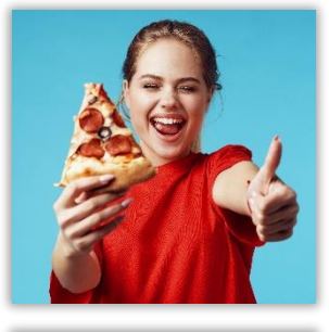
favorite (adj.)My favorite food is pizza.