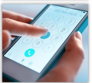
cellphone number (phr.)

We visit grandparents' house every Sunday.