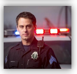
police officer (n.)

A nurse cares for people who are ill or injured, especially in a hospital